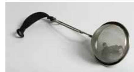
Endoscopy Accessory holder